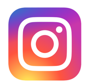
Instagram niagaracatholicdsb st.denis_ces